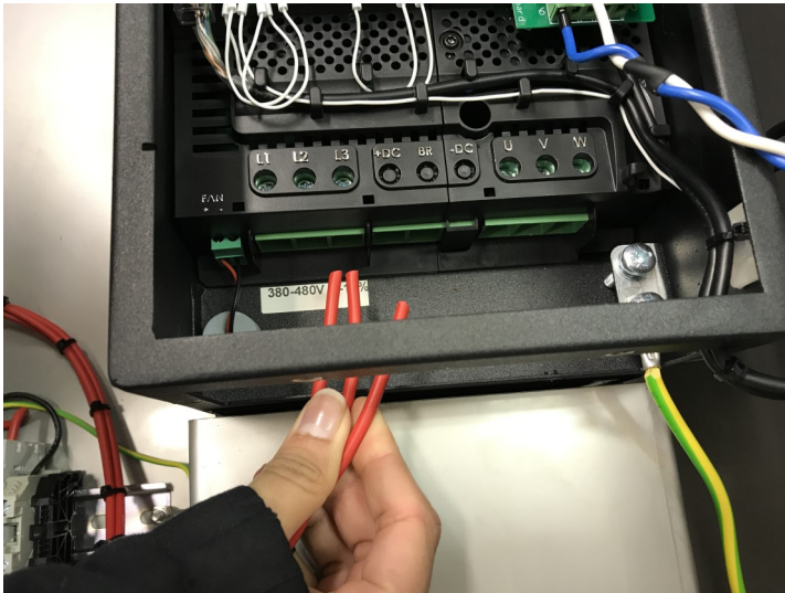
Connect the 3 red wires to L1, L2 and L3 together with the incoming phase wires for the VSD