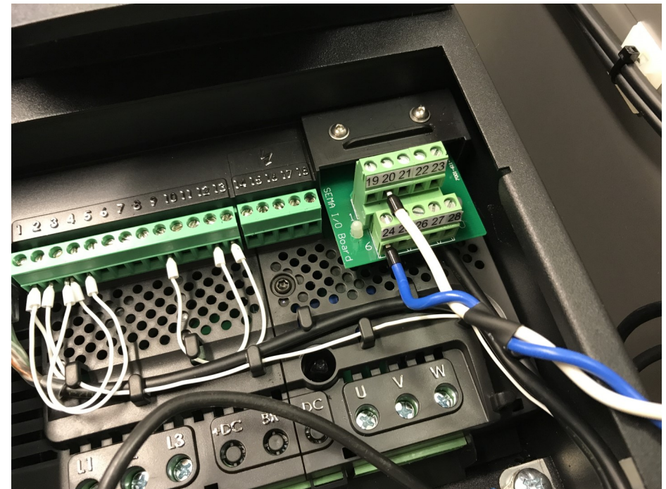
Connect the white wire to terminal 20 and the blue wire to terminal 24.